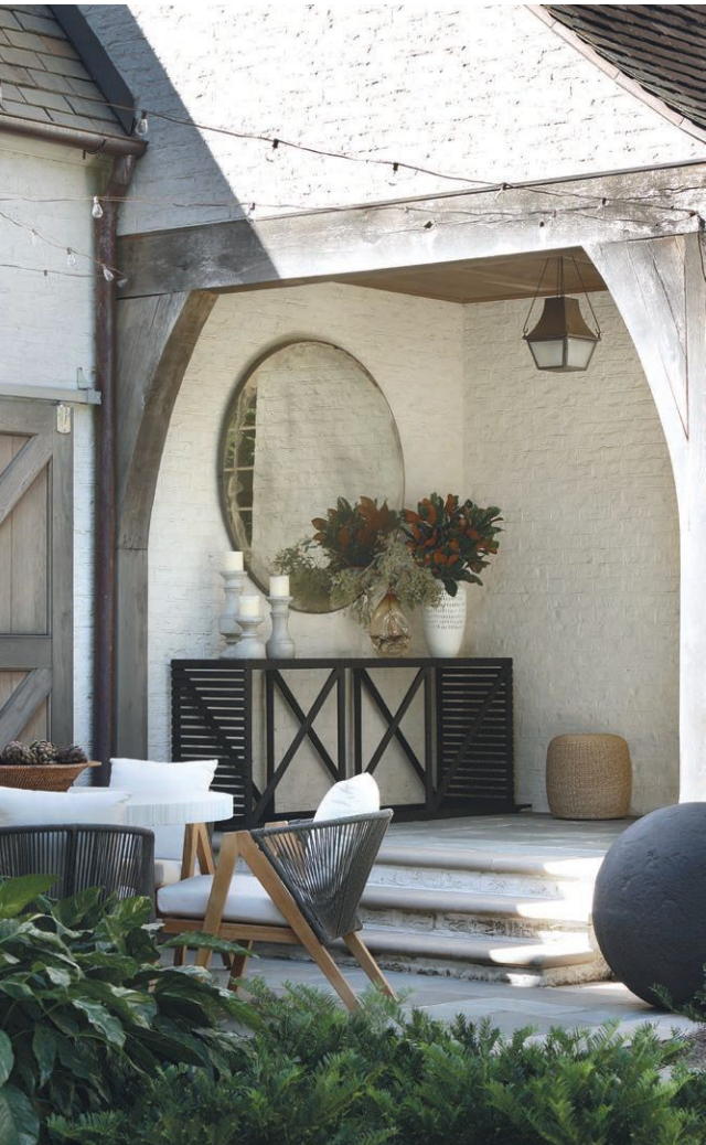
From left: A console sourced from Holland MacRae and a mirror sourced from B.D. Jeffries emphasize indoor-outdoor living; another view from the covered patio.